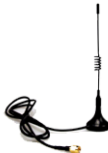
Small acetabula antenna